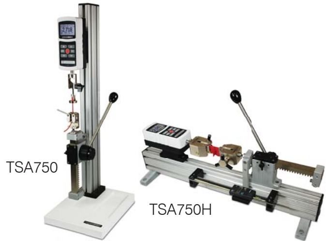
The TSA750 and TSA750H are shown testing the peel force of a sample, with a Series 5 digital force gauge, and film & paper grips